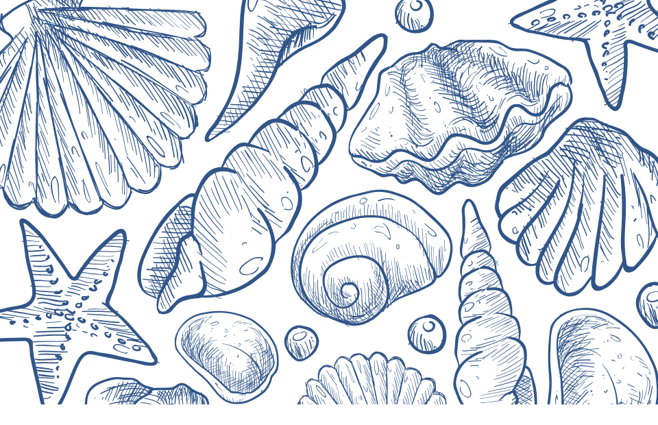
You're Invited to a Welcome Reception! Grand Master's Weekend in the South